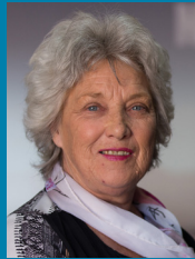
MAYOR Cathy Redding

SHARING YOUR COUNCIL NEWS WITH THE COMMUNITY 20 April 2017